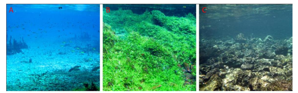
Fig. 2 - Three different freshwater habitats at Olho d'água stream. A: lacustrine, B: plantdominated, and C: rocky habitats.

Fig. 1 - A: Scuba diving in Arraial do Cabo for observing rock reef; B: Ichthyofauna assessment in a small lagoon, Bombinhas city; C: Analyses of stomach contents from reef fishes.