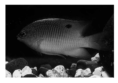
Fig. 6. Stegastes fuscus trindadensis (MBML 229), juvenile, 45.5 mm SL, a new damselfish subspecies from Trindade Island.

plankton (Thresher, 1991). Demersal spawners probably underwent fast isolation and divergence from parental populations due to smaller chances of repeated arrivals. The great morphological similarity between most of the endemic species of Trindade and their likely continental margin sister species (e.g., Scartella sp. vs. Scartella aff. cristata (Linnaeus, 1758), Elacatimus sp. vs. Elacatimus figaro Sazima, Moura and Rosa, 1997) suggests a recent divergence between the faunas of the Brazilian continental shelf and Trindade. This recent divergence is interpreted as having begun during the Flandrian Transgression, an event which may have interrupted a phase of increased faunal interchange between the Brazilian continental shelf and its offshore islands during the late Pleistocene Regression.