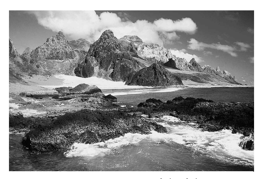
Fig. 2. Volcanic reefs at Trindade Island (20°30'S, 29°20'W), off Brazil.

Filho, 1982). A tropical oceanic climate prevails, ameliorated by eastern and southern trade winds, with mean water temperatures of 27°C (DHN, 1968).