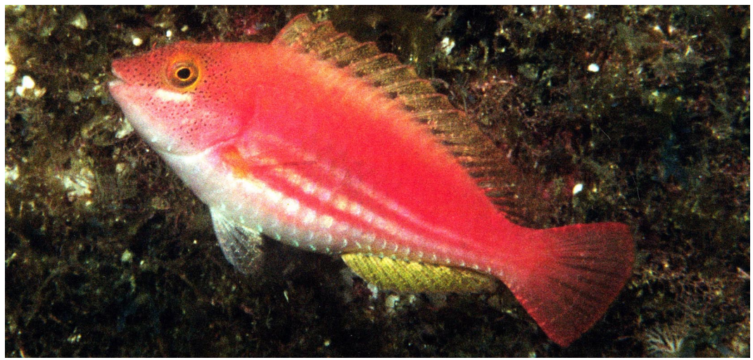
FIGURE 4. Sparisoma tuiupiranga sp. n., live specimen. Laje de Santos Marine State Park (24°15′S; 46°10′W), São Paulo, Brazil, 16m deep (specimen not collected, juvenile, ca. 14-15 cm TL).

belly. All red bands initiate at the height of pectoral fin insertion, and end at the base of the caudal fin, with the exception of the lower one which disappears toward the rear half of the anal fin. From the gular region to the insertion of the caudal fin, the body is white (striped by the lowest and less defined red band), with iridescent blue on the edges of ventral scales, especially on the belly and above the anal fin. Above the white gular region, the head is sparkled with small dark red spots on a pink to red background. Eye orbit is gold yellow, and the eye is grayish red to vivid yellow at the border of the iris. The eye is underlined by an almost horizontal white band, about the size of the eye in length and slightly smaller than that of the pupil in height.