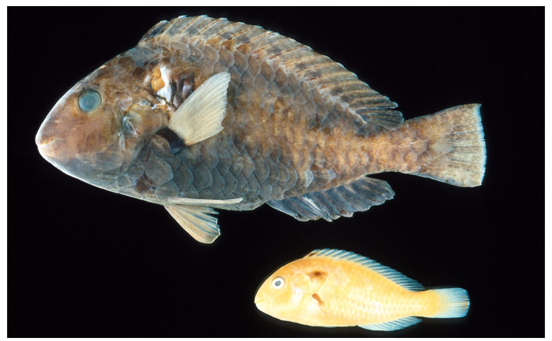
FIGURE 5. Above: Sparisoma tuiupiranga sp. n. (holotype, UFES 1821, terminal phase male 144.1 mm SL). Lower: Sparisoma atomarium (Poey, 1861; UF 227038, terminal phase male from Yucatan Channel, Quintana Roo, Mexico, 68.6 mm SL).

Initial phase adults are beige-brownish with a large, irregular, oblong, horizontal dark blotch along the mid-line, from after the opercle to above the insertion of the anal fin. Below it, the belly is brownish. The bases of pectoral fin rays are dark. On the head, including the opercle and excluding to the lower gular region, are numerous small brown dots on a beige background. All fins are pale, the dorsal having a small dark spot on the first interspinous membrane.