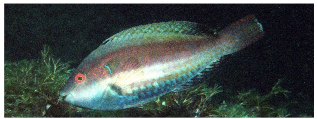
FIGURE 2. Sparisoma tuiupiranga sp. n., live specimen. Laje de Santos Marine State Park (24°15′S; 46° 10′W), São Paulo, Brazil, 16m deep (specimen not collected, male, sub-terminal phase, ca. 14–15 cm TL). Underwater photograph by Osmar José Luiz-Júnior.

Color of terminal males at a cleaning station may be very different from that displayed in other occasions, generally almost uniformly olive green with only the red eye, the iridescent blue crescent, and the dark pectoral fin base underlined of turquoise blue being readily apparent above the background.