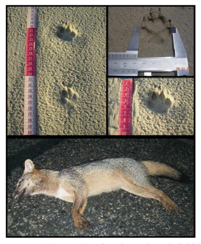
Figure 1. Cerdocyon thous footprints and one individual found as road-kill near the study area.

A significant difference was observed between the rate of predation of nests protected with grids alone vs. nests with grids